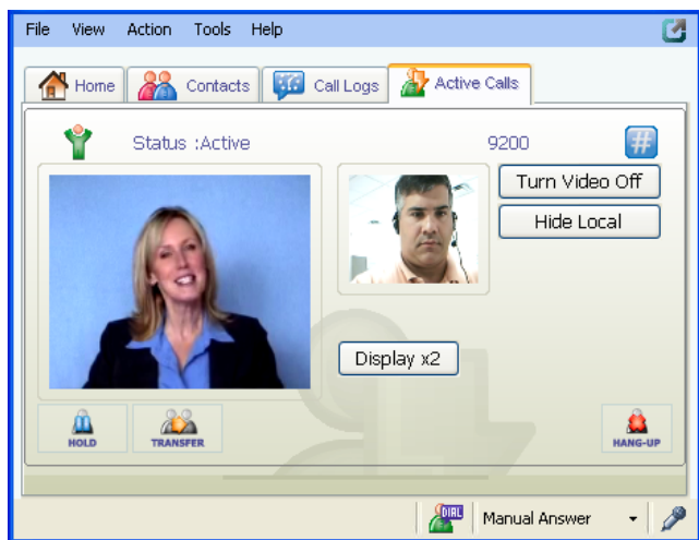
Call Window with Video Call